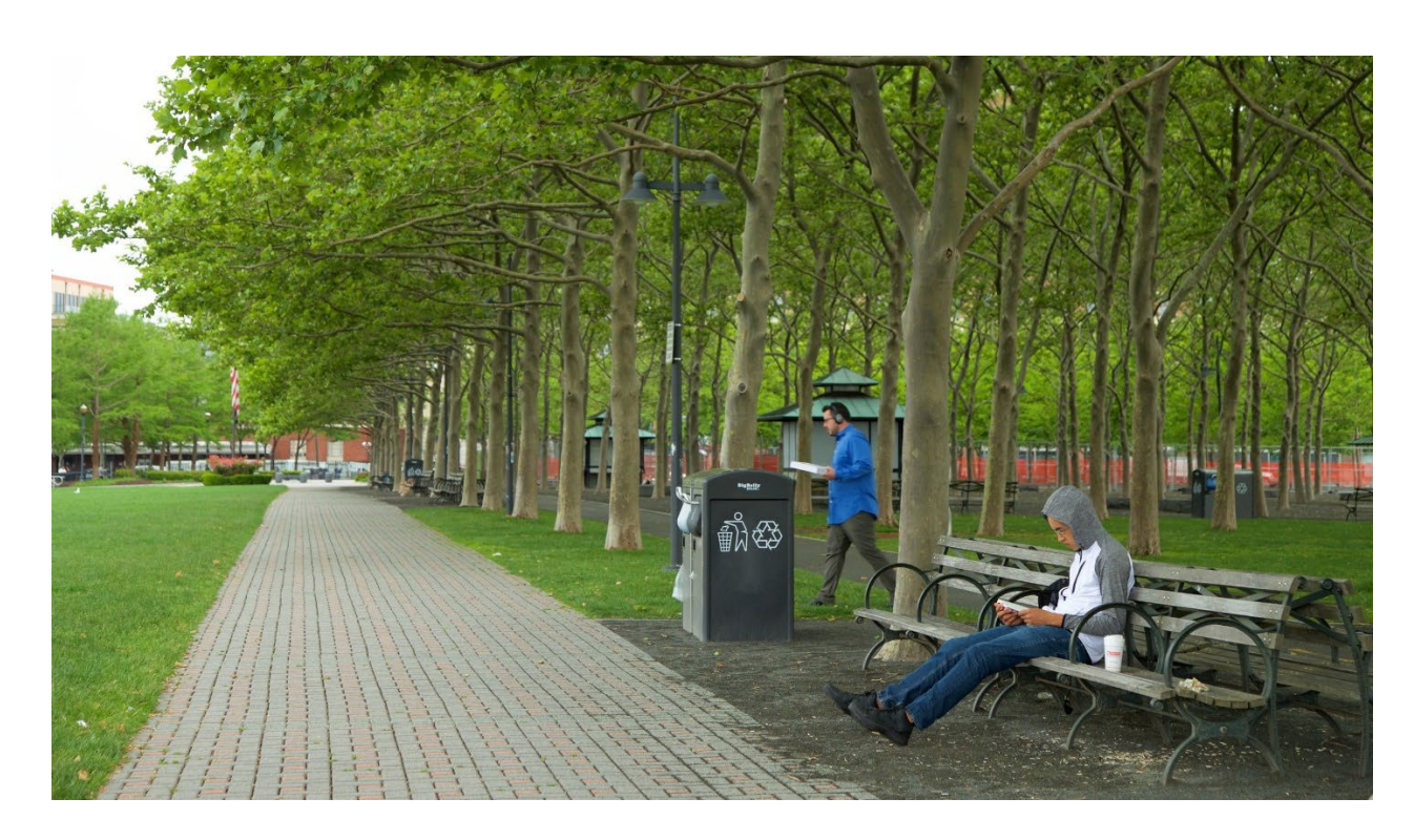
Photo 1: Mature trees growing in three feet of soil on pier deck at Hoboken Riverside Park, New Jersey

Similar soil depths to the three feet proposed have led to successful tree development on other projects. One example is the Hoboken Waterfront Redevelopment project, which involved three feet of soil for trees over drainage/insultation layers on pier deck park. The project was completed in the 1990's and successful mature tree plantings have been established (image below).